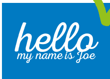
Advert within safe area

All of our advert templates contain a safe area - the space on the advert where it is 'safe' to put your layout, design and content - ensuring it is not trimmed off.